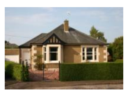
Road Car Parking, Garage.

"Balgonie", 2 House O' Hill Green, Vau County of Montrose Gotzborg, 363-800 Fixed Price Th 5,655